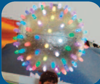
The ball drop is always a crowd favorite.