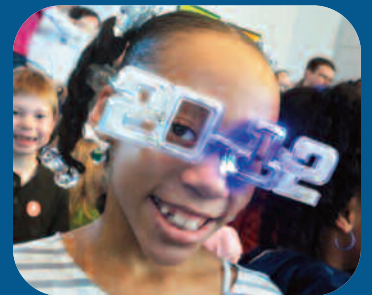
It looks like 2012 is going to be a bright year!