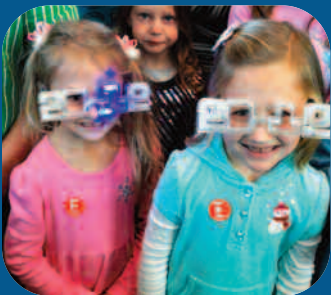
Fun sunglasses brought big grins.

If you weren't here to see the ball drop, confetti fly, and children count down...you missed a good time! EdVenture's annual celebration brought many smiles and laughs into the New Year.