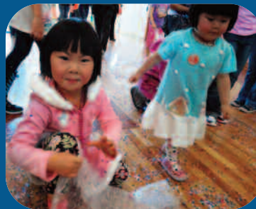
Confetti fell from the sky as the clock struck noon.